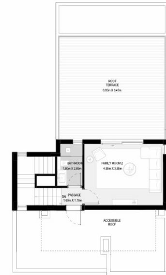
SECOND FLOOR (ROOF)