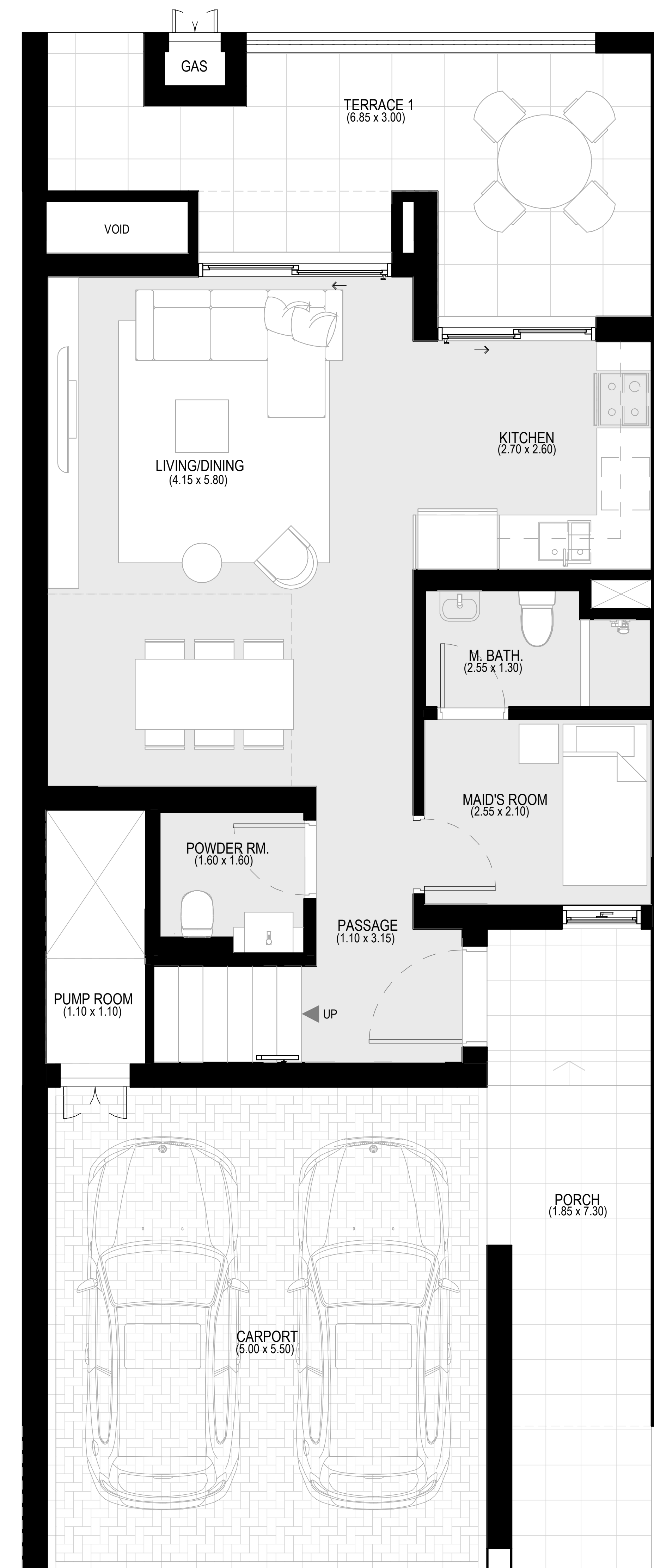
GROUND FLOOR PLAN (SKYLIGHT PROVIDED ABOVE DINING SPACE)